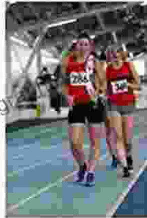
Fáiltecht Cumming & Biv Tury