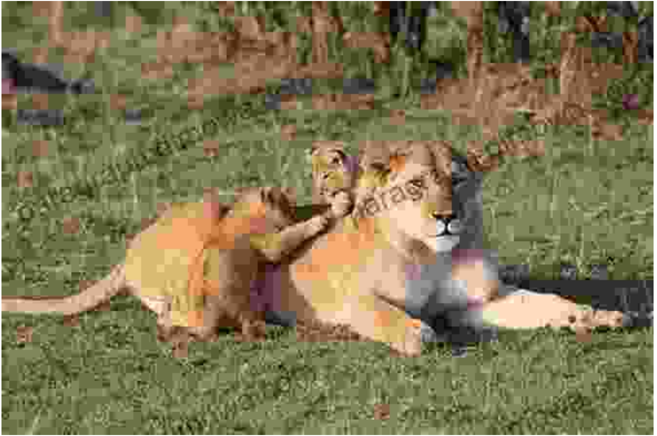
Sarah training a lion cub