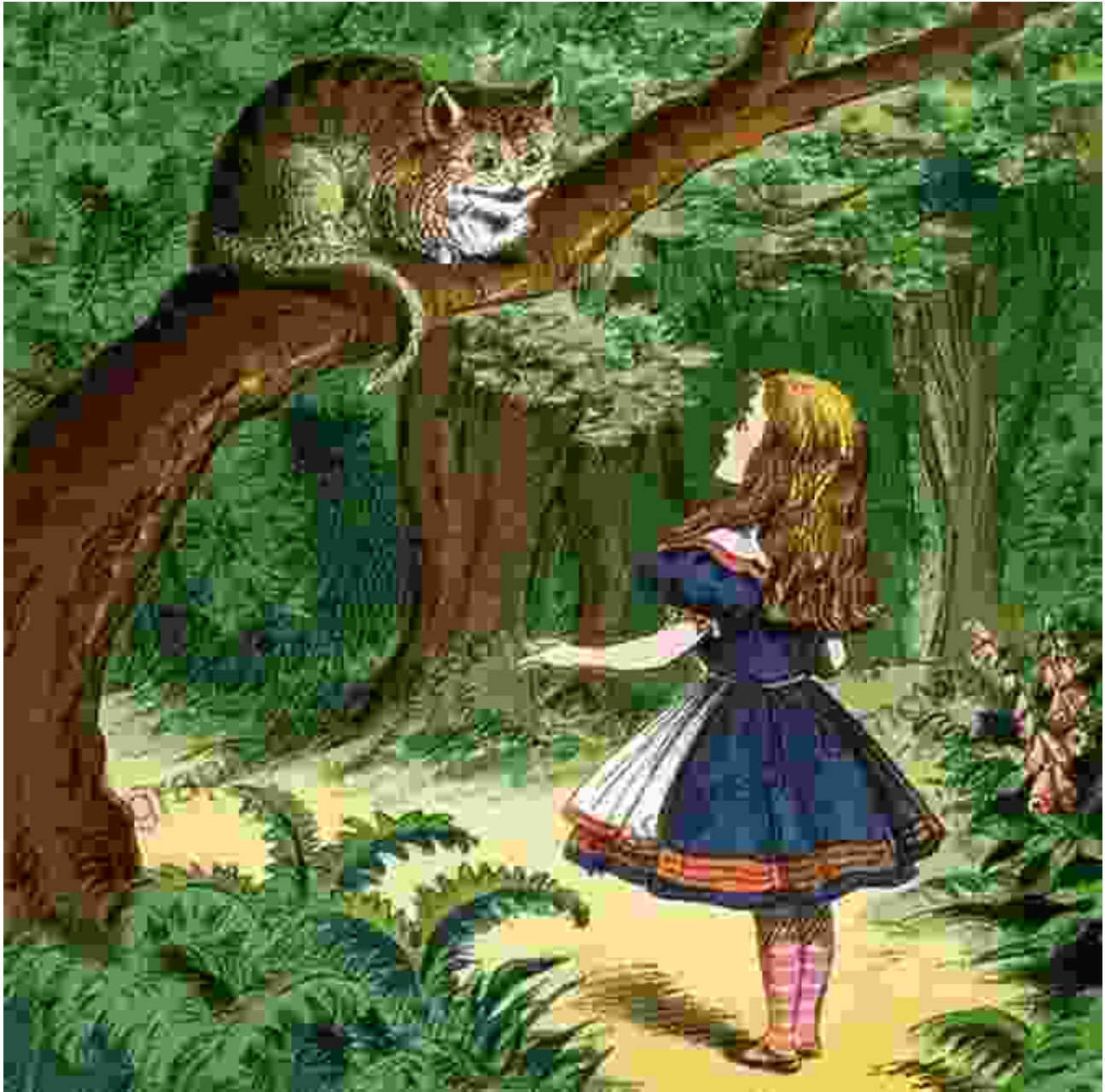
Alice seeking guidance from the enigmatic Cheshire Cat

As Alice traverses the labyrinthine paths of Wonderland, she encounters the Cheshire Cat, a feline enigma with a penchant for disappearing and reappearing. Through its enigmatic grin and cryptic words, the Cheshire Cat provides Alice with cryptic guidance, leading her on her extraordinary quest.