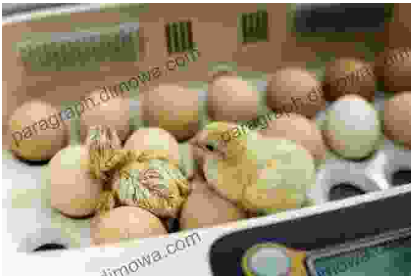
Image 4: Embark on an intriguing adventure into the realm of egg production and incubation, mastering the skills to raise and breed your own chickens.

For those interested in raising chickens for egg production, Chapter 4 delves into the fascinating world of egg laying. Byard explains the reproductive cycle of chickens and provides practical tips for maximizing egg production. He also covers the art of incubation, guiding you through the process of hatching your own chicks and expanding your flock. With his expert guidance, you'll gain the knowledge and confidence to successfully raise and breed your own chickens.