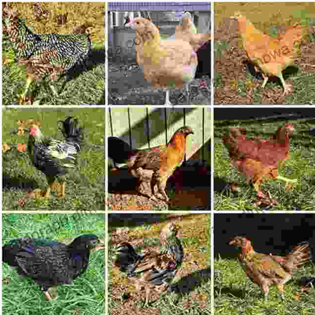
Image 2: Embark on a captivating journey through the myriad of chicken breeds, each with its own distinct charm and purpose.

Cornish Cross, he provides detailed descriptions and stunning photographs to help you make an informed decision.